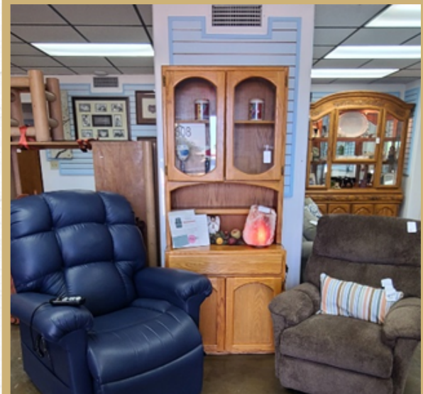
The brand-new blue lift-chair donated looks beautiful alongside out newly painted blue walls.

Kris our volunteer showing off all the summer throw pillows that were donated by Big Lots!